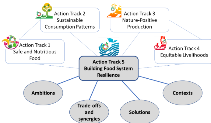
Figure 1. Representation of the integrative perspective of Action Track 5 across other action tracks and key elements addressed by Action Track 5 to build food system resilience.

The concept of resilience first emerged in the context of ecological stability theory (Holling 1973). It was directed at understanding the capacity of ecosystems to sustain perturbations persisting in the original state.